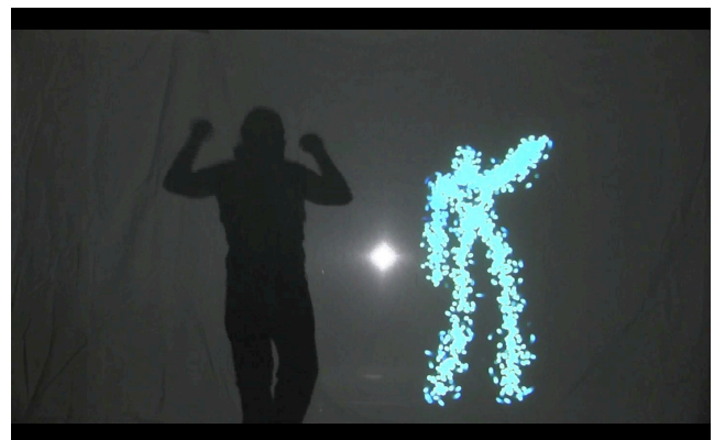
Figure 1: A human interactor and VAI co-creating a movement-based proto-narrative in a liminal virtual / real projected plane.

The Viewpoints AI system has been created as an exploratory AI / art research platform for understanding how